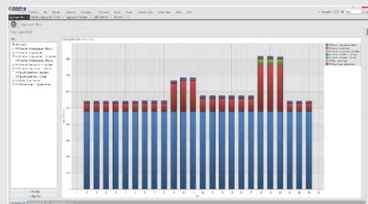
Portfolio availability dashboard