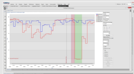
Event information at a glance