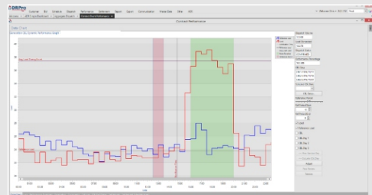
Event information at a glance