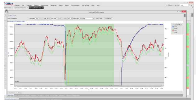
Real-time event information at a glance

Instantaneous Demand Response is a key tool for a utility or system operator to manage the network frequency.